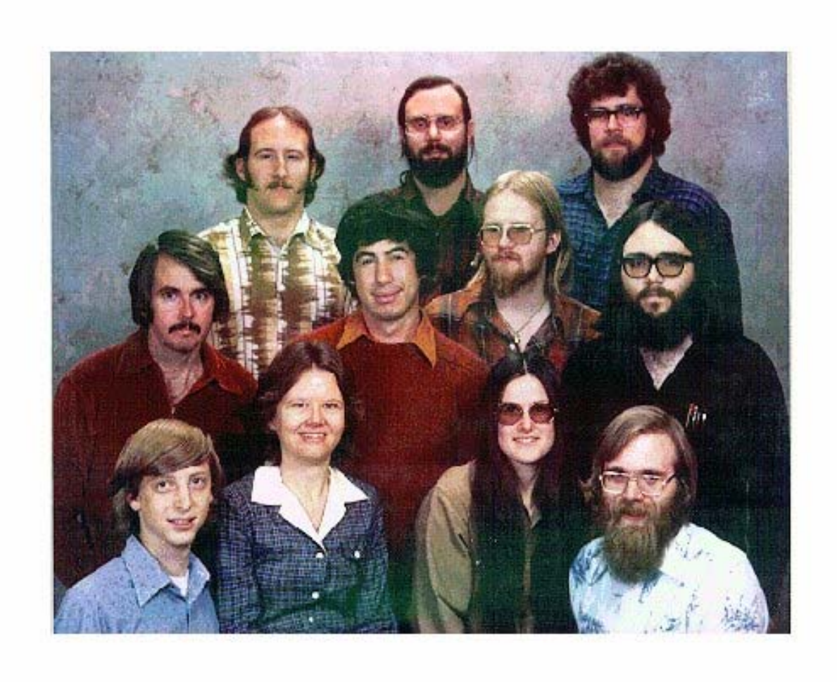
Microsoft Corporation, 1978